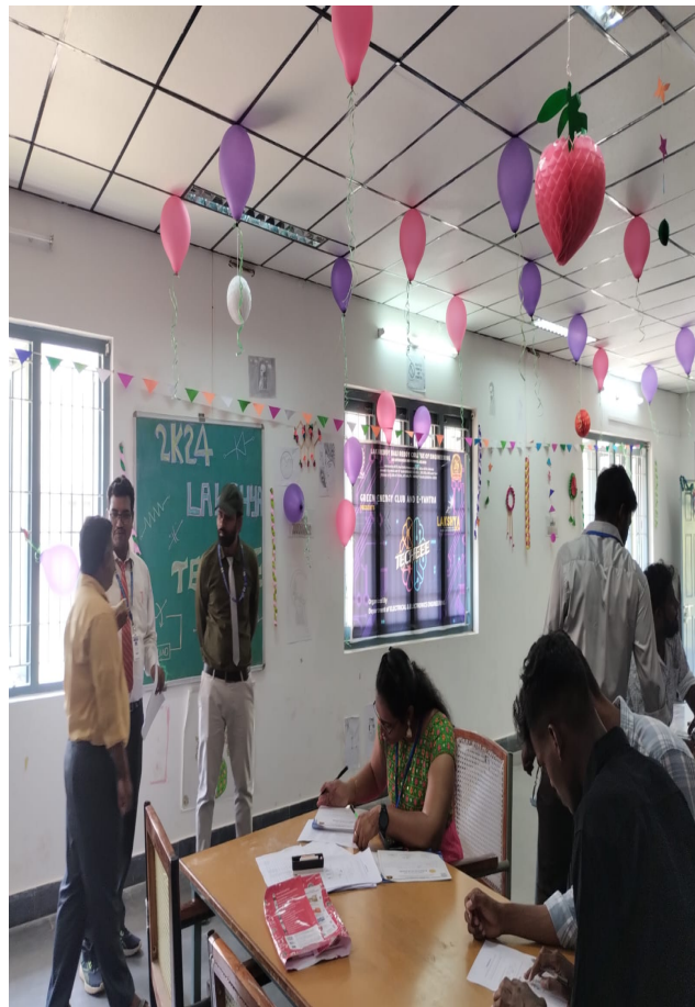
Participants participation in TECHEEE