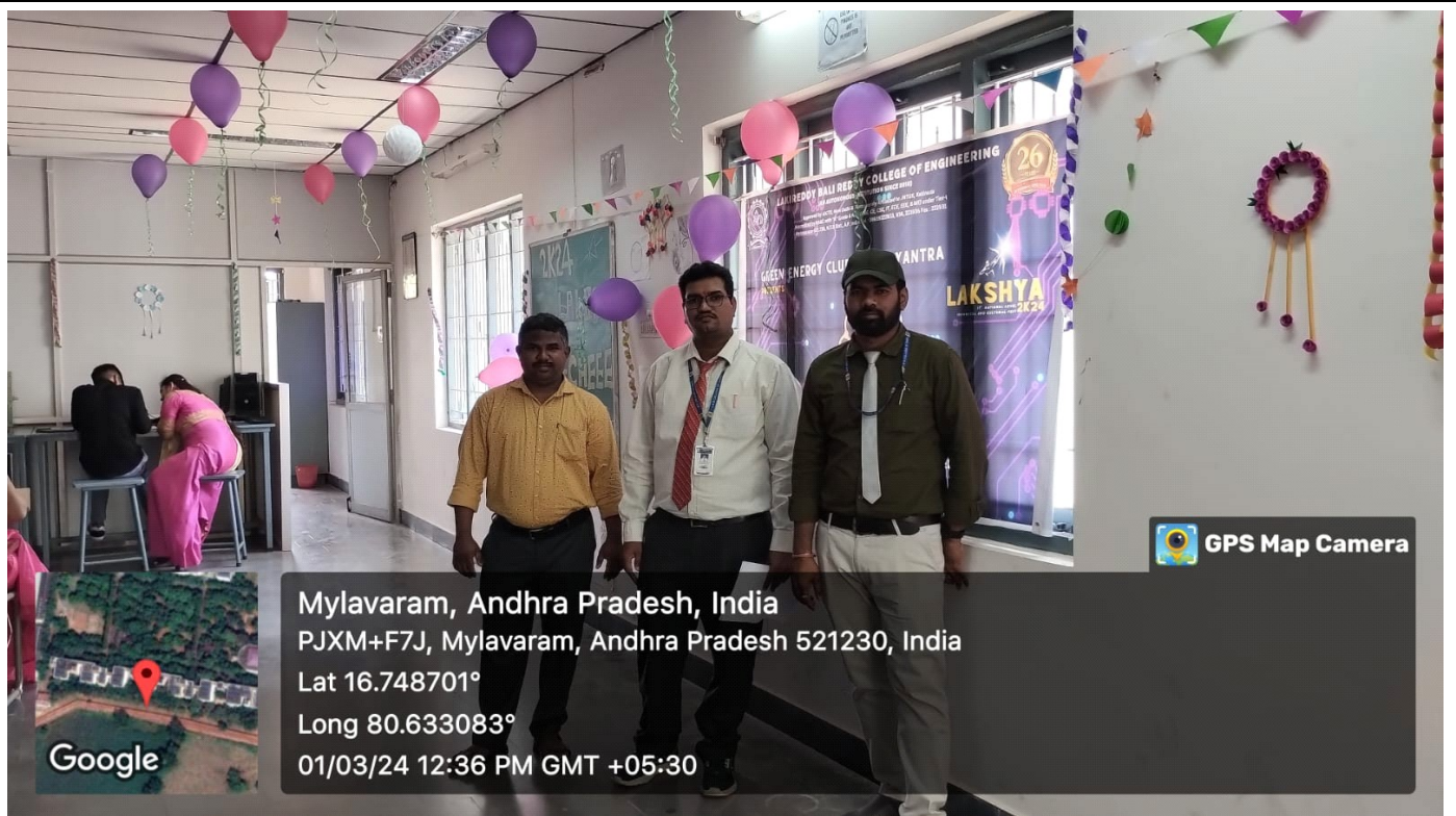
Judge & Coordinators